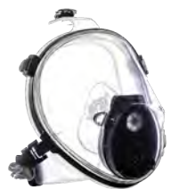
Full Face Mask CST1017 - Small CST1018 - Medium/Large