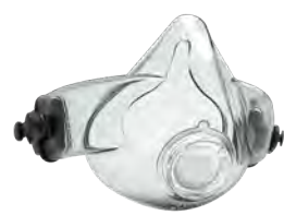
Half Mask (includes head harness) CST1034 - Small CST1035 - Medium CST1036 - Large