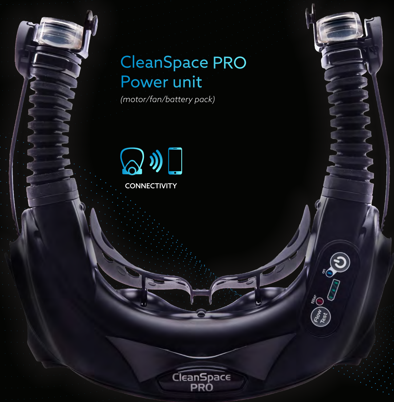
CleanSpace PRO Power unit