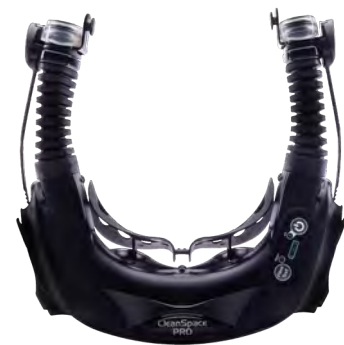
CleanSpace PRO CST1000

Power unit* includes neck supports, charger & carry bag *excludes mask and filter